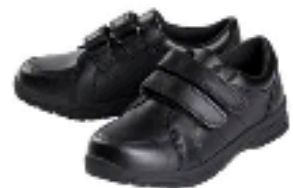
strong black shoes