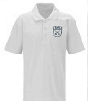
spare polo shirt